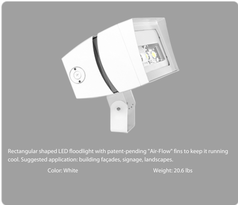
Rectangular shaped LED floodlight with patent-pending "Air-Flow" fins to keep it running cool. Suggested application: building façades, signage, landscapes.