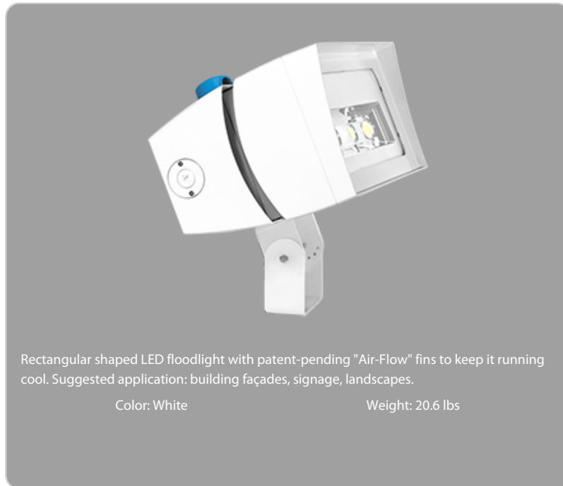
Rectangular shaped LED floodlight with patent-pending "Air-Flow" fins to keep it running cool. Suggested application: building façades, signage, landscapes.