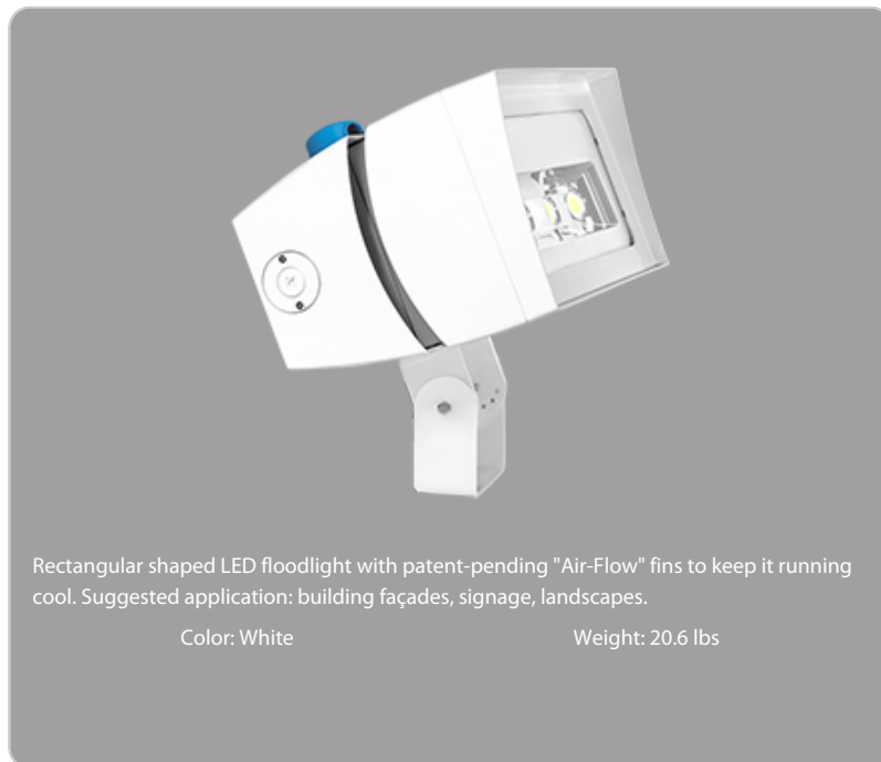
Rectangular shaped LED floodlight with patent-pending "Air-Flow" fins to keep it running cool. Suggested application: building façades, signage, landscapes.