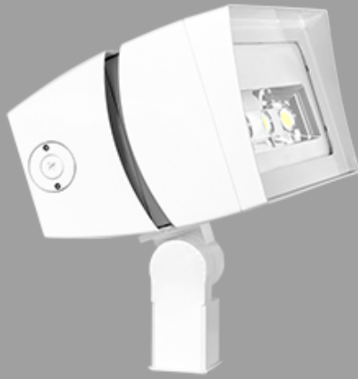
Rectangular shaped LED floodlight with patent-pending "Air-Flow" fins to keep it running cool. Suggested application: building façades, signage, landscapes.