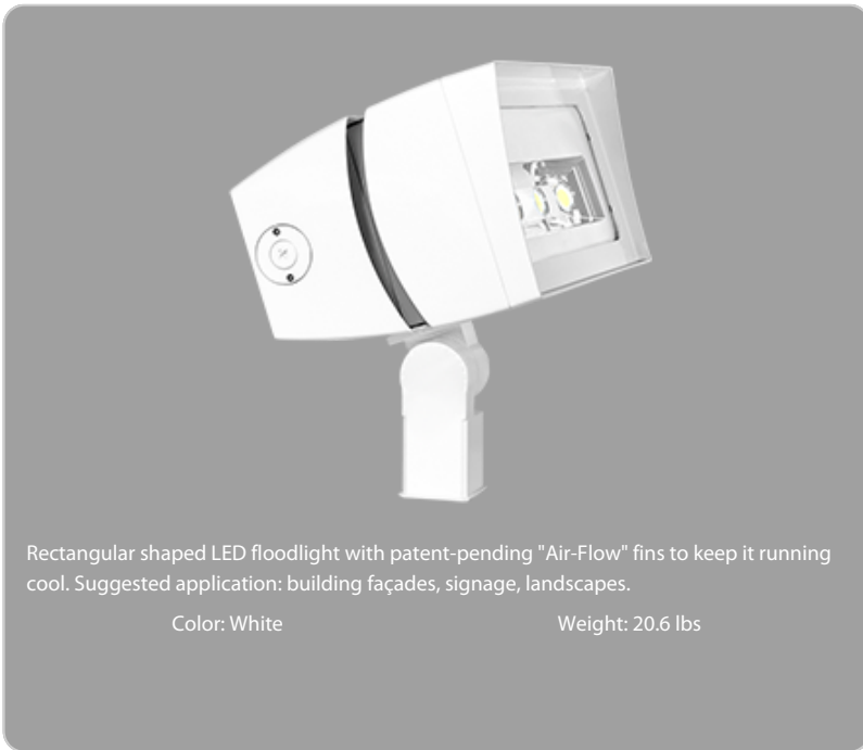
Rectangular shaped LED floodlight with patent-pending "Air-Flow" fins to keep it running cool. Suggested application: building façades, signage, landscapes.