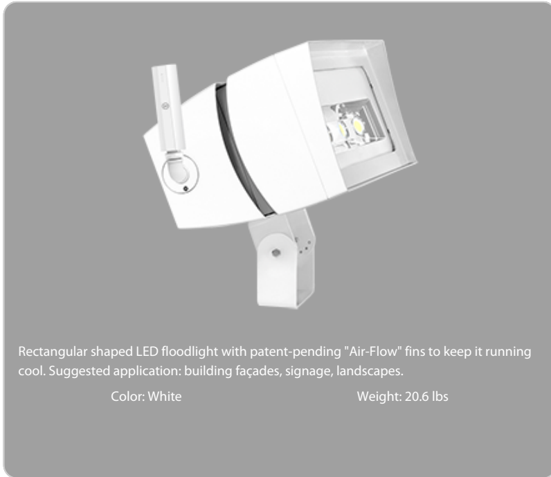
Rectangular shaped LED floodlight with patent-pending "Air-Flow" fins to keep it running cool. Suggested application: building façades, signage, landscapes.