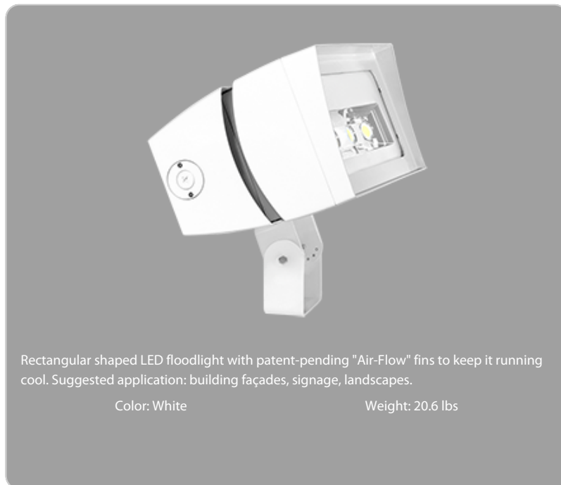
Rectangular shaped LED floodlight with patent-pending "Air-Flow" fins to keep it running cool. Suggested application: building façades, signage, landscapes.