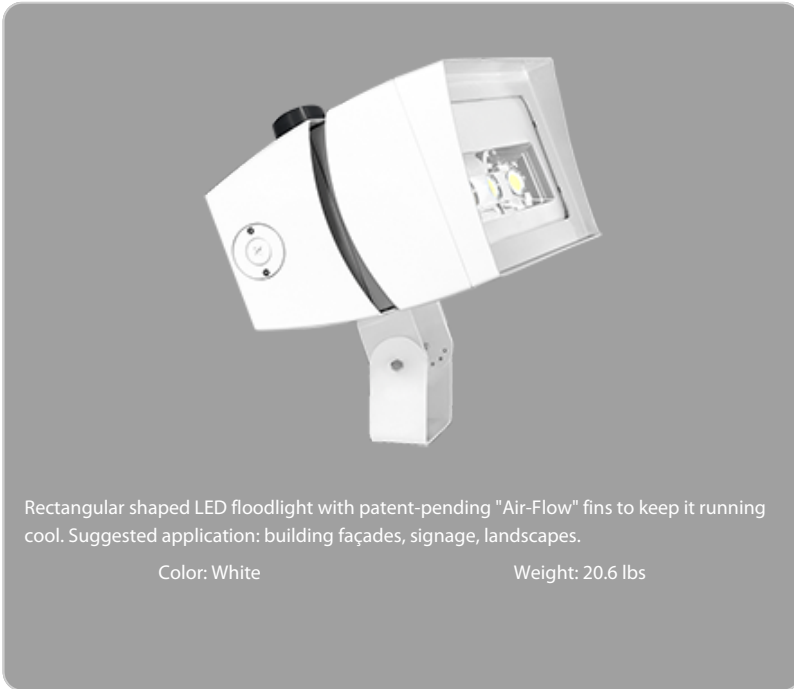
Rectangular shaped LED floodlight with patent-pending "Air-Flow" fins to keep it running cool. Suggested application: building façades, signage, landscapes.