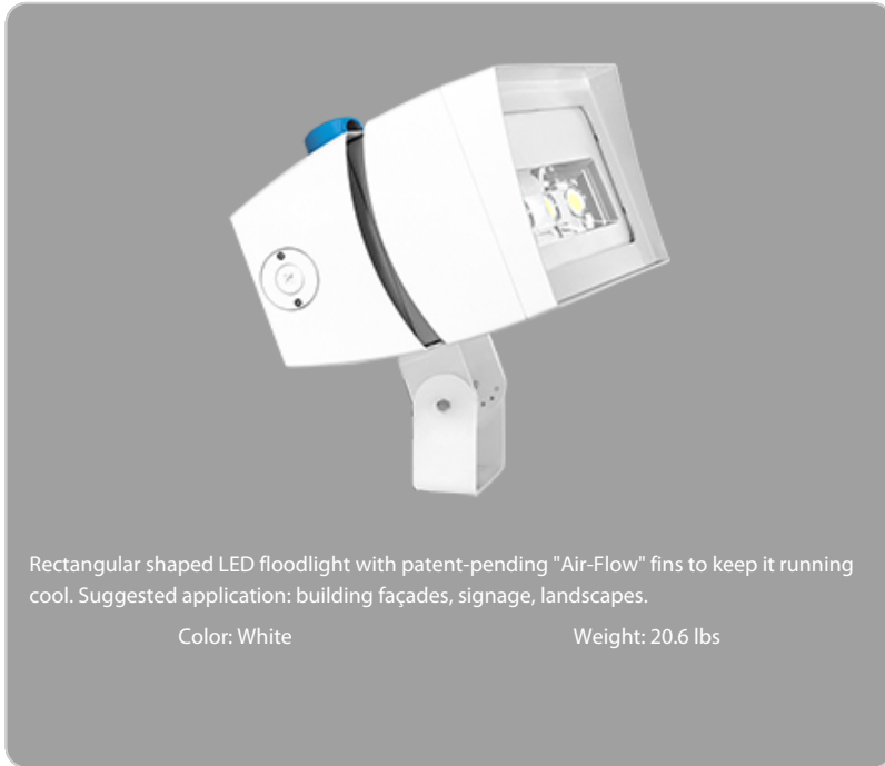
Rectangular shaped LED floodlight with patent-pending "Air-Flow" fins to keep it running cool. Suggested application: building façades, signage, landscapes.