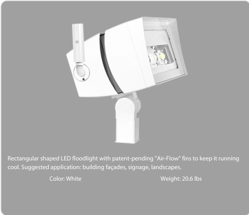
Rectangular shaped LED floodlight with patent-pending "Air-Flow" fins to keep it running cool. Suggested application: building façades, signage, landscapes.