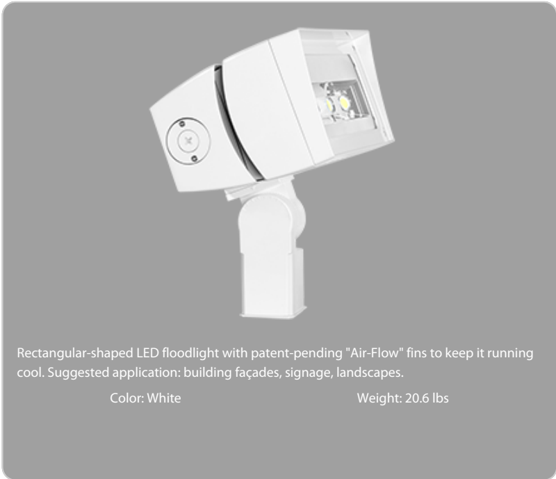
Rectangular-shaped LED floodlight with patent-pending "Air-Flow" fins to keep it running cool. Suggested application: building façades, signage, landscapes.