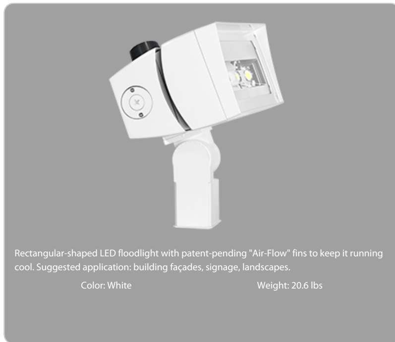
Rectangular-shaped LED floodlight with patent-pending "Air-Flow" fins to keep it running cool. Suggested application: building façades, signage, landscapes.