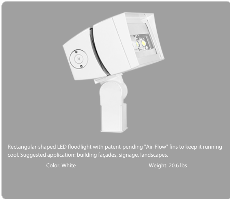
Rectangular-shaped LED floodlight with patent-pending "Air-Flow" fins to keep it running cool. Suggested application: building façades, signage, landscapes.