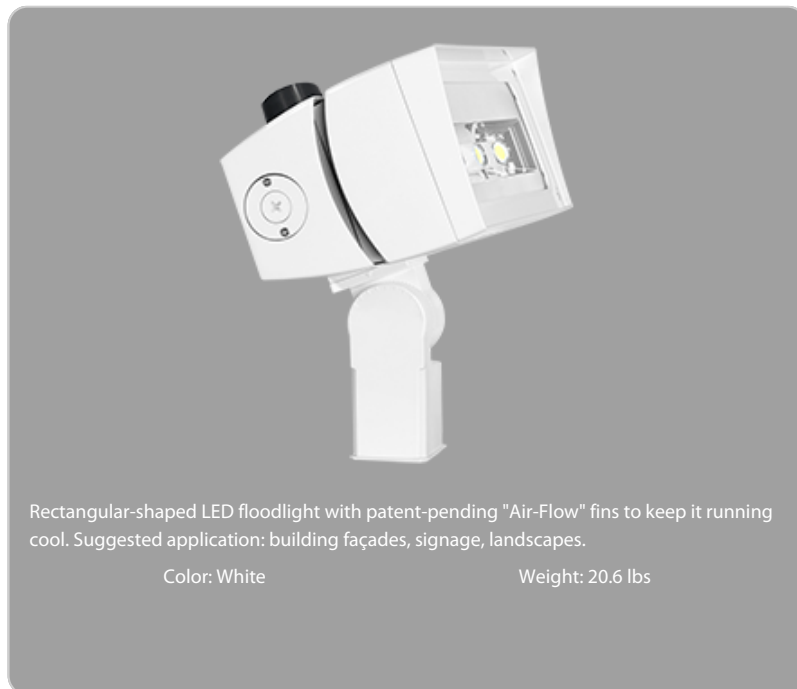
Rectangular-shaped LED floodlight with patent-pending "Air-Flow" fins to keep it running cool. Suggested application: building façades, signage, landscapes.