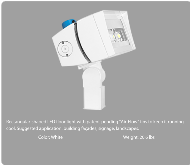
Rectangular-shaped LED floodlight with patent-pending "Air-Flow" fins to keep it running cool. Suggested application: building façades, signage, landscapes.