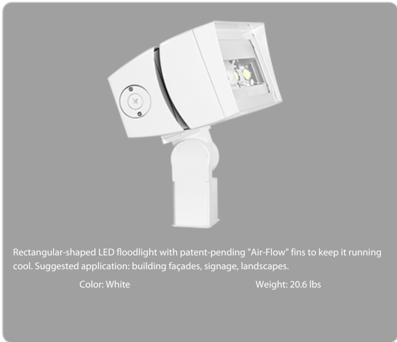
Rectangular-shaped LED floodlight with patent-pending "Air-Flow" fins to keep it running cool. Suggested application: building façades, signage, landscapes.