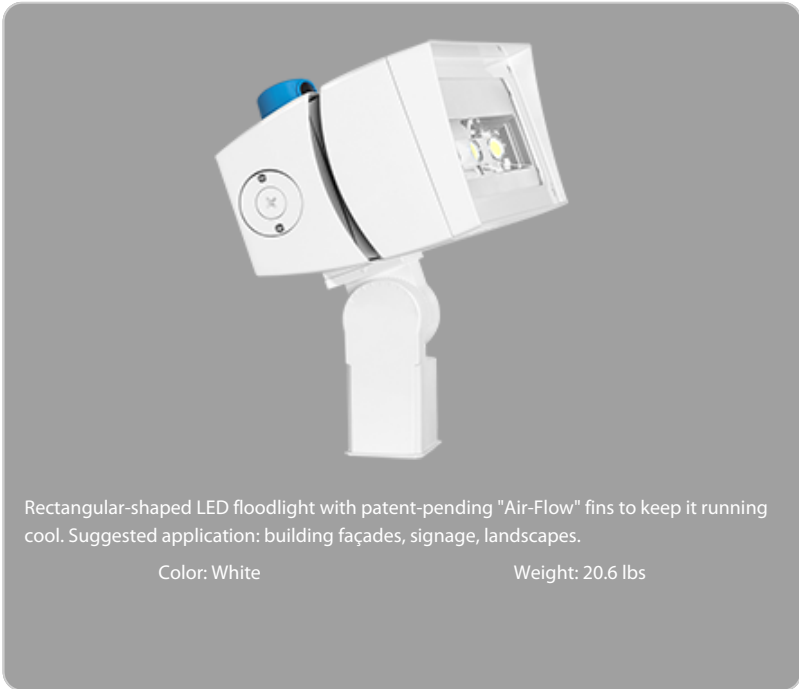
Rectangular-shaped LED floodlight with patent-pending "Air-Flow" fins to keep it running cool. Suggested application: building façades, signage, landscapes.