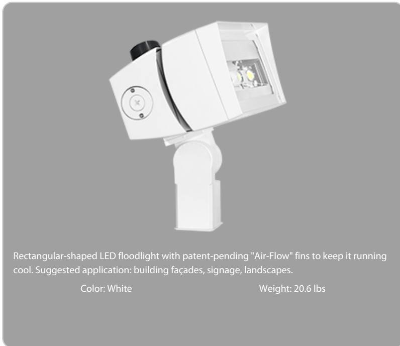
Rectangular-shaped LED floodlight with patent-pending "Air-Flow" fins to keep it running cool. Suggested application: building façades, signage, landscapes.