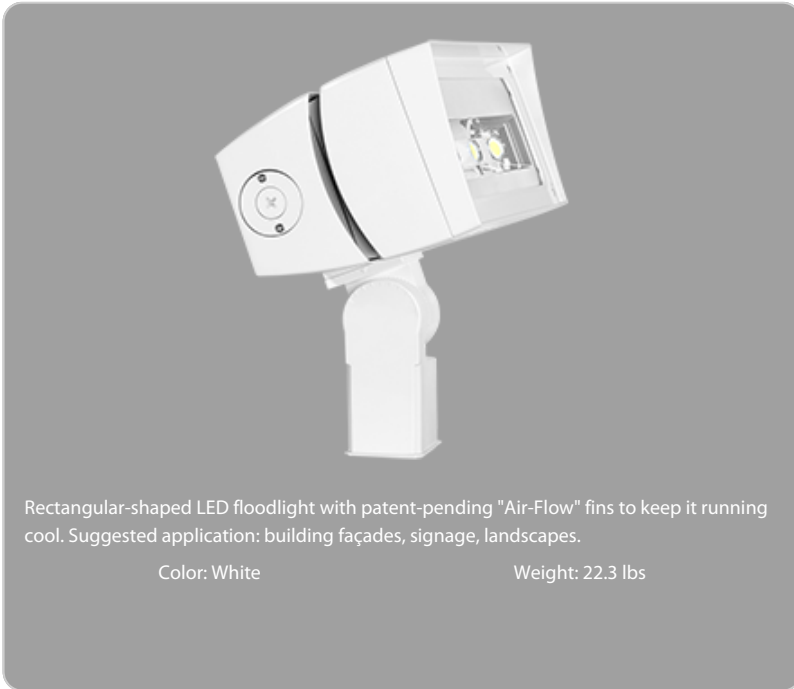
Rectangular-shaped LED floodlight with patent-pending "Air-Flow" fins to keep it running cool. Suggested application: building façades, signage, landscapes.