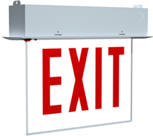
Weight: 6.2 lbs