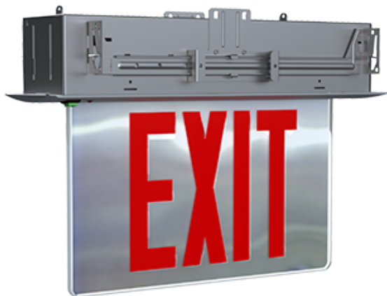
Weight: 8.2 lbs