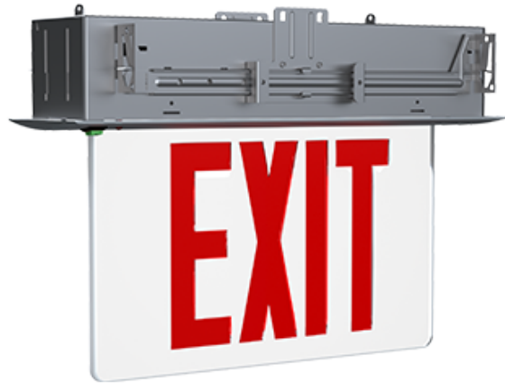
Weight: 8.2 lbs