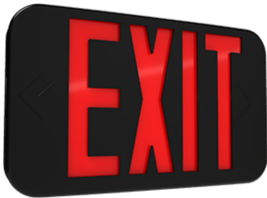
Weight: 1.7 lbs