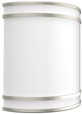
Color: Brushed nickel