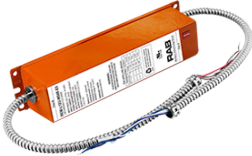
Weight: 3.0 lbs