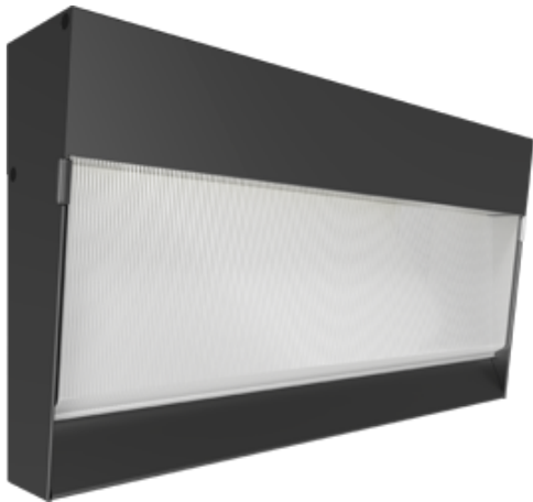
Color: Bronze Weight: 7.8 lbs