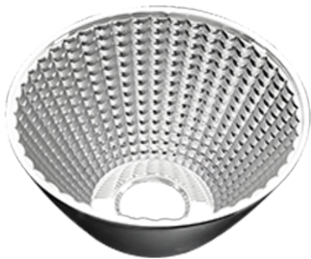
Weight: 0.1 lbs