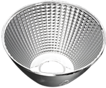
Weight: 0.1 lbs