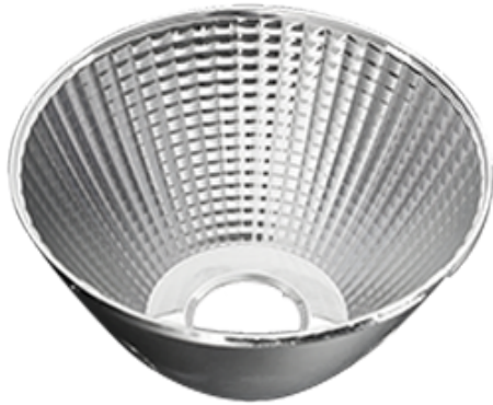
Weight: 0.1 lbs