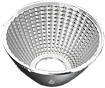
Weight: 0.0 lbs