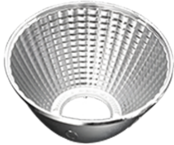
Weight: 0.0 lbs