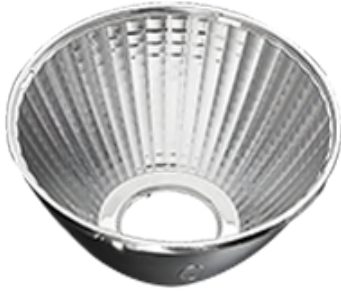
Weight: 0.0 lbs