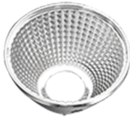
Weight: 0.0 lbs