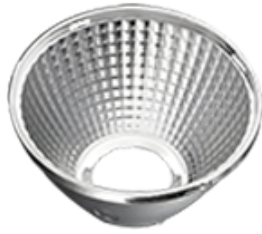
Weight: 0.0 lbs