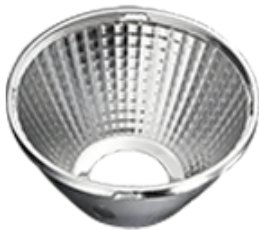
Weight: 0.0 lbs