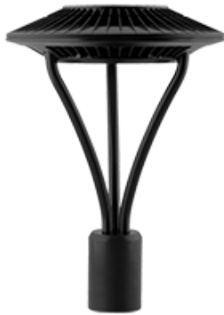
High output LED pole top area light with IES type V circular distribution. Wide and uniform 360 degree pattern ideal for large outdoor areas such as parking lots, corporate parks, and retail settings. Color: Black Weight: 21.8 lbs