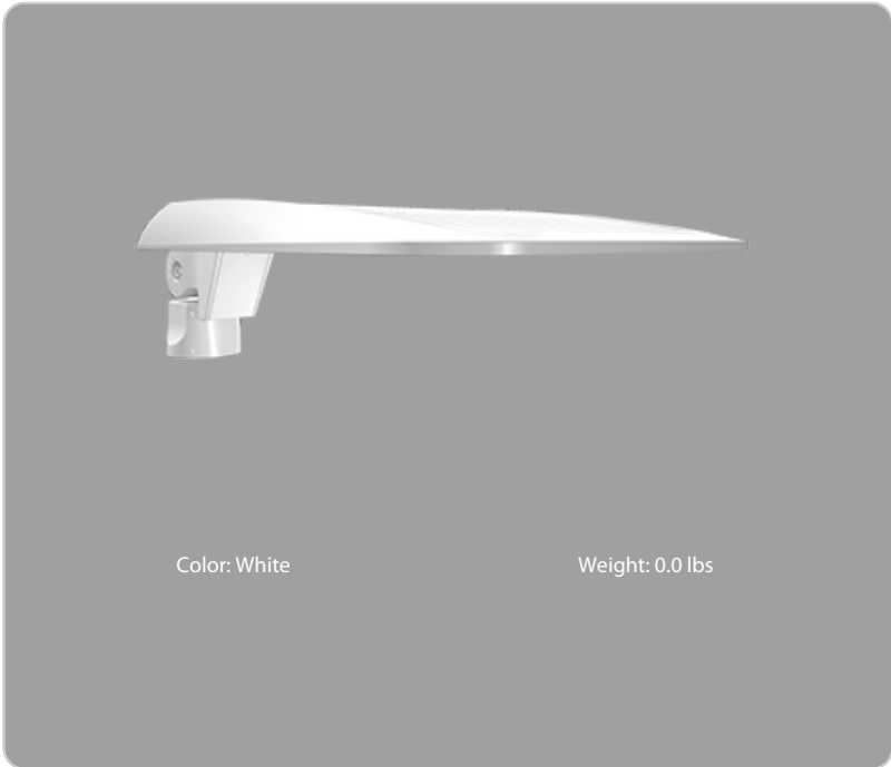
Color: White Weight: 0.0 lbs