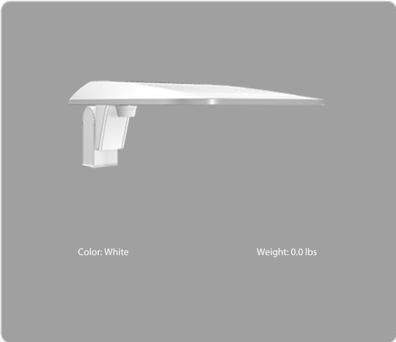
Color: White Weight: 0.0 lbs