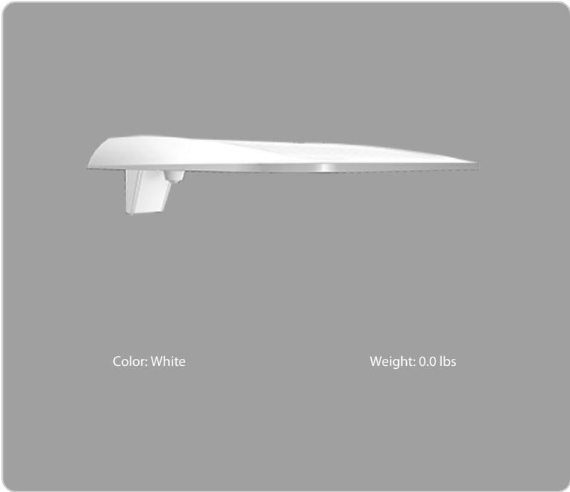
Color: White Weight: 0.0 lbs