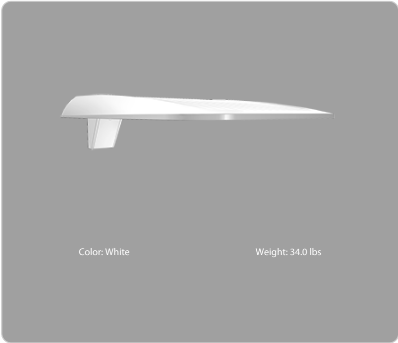
Color: White Weight: 34.0 lbs