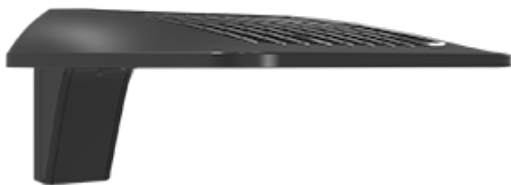
Color: Bronze Weight: 12.4 lbs