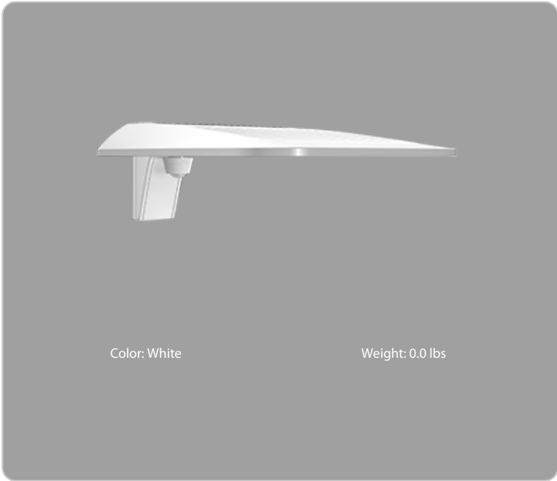
Color: White Weight: 0.0 lbs