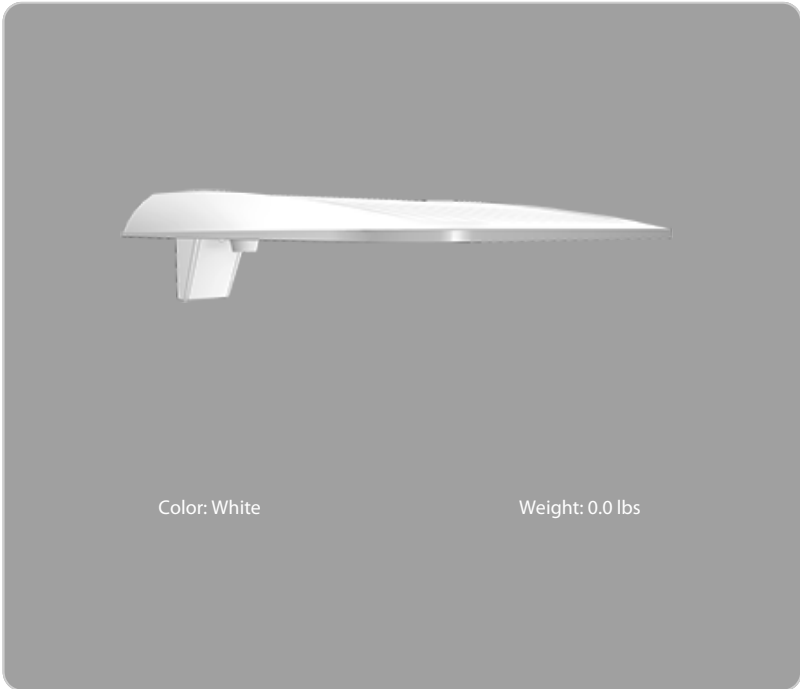
Color: White Weight: 0.0 lbs