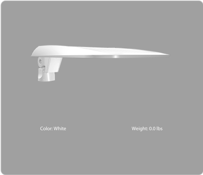
Color: White Weight: 0.0 lbs