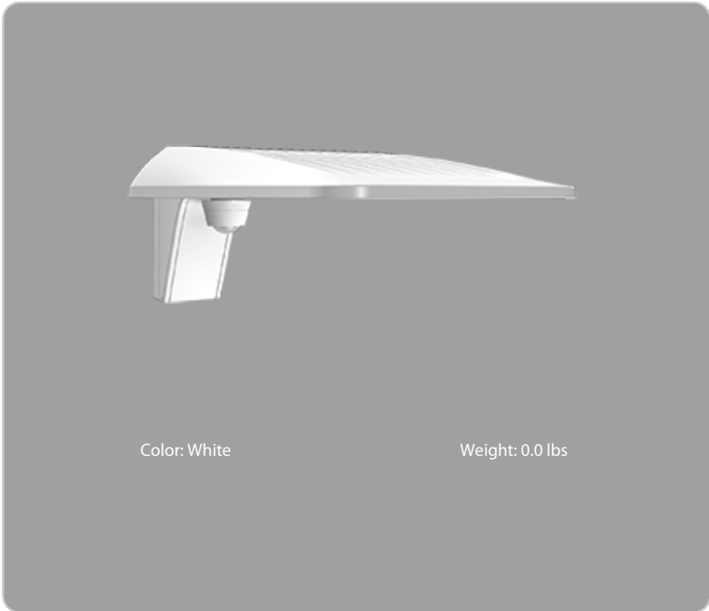
Color: White Weight: 0.0 lbs