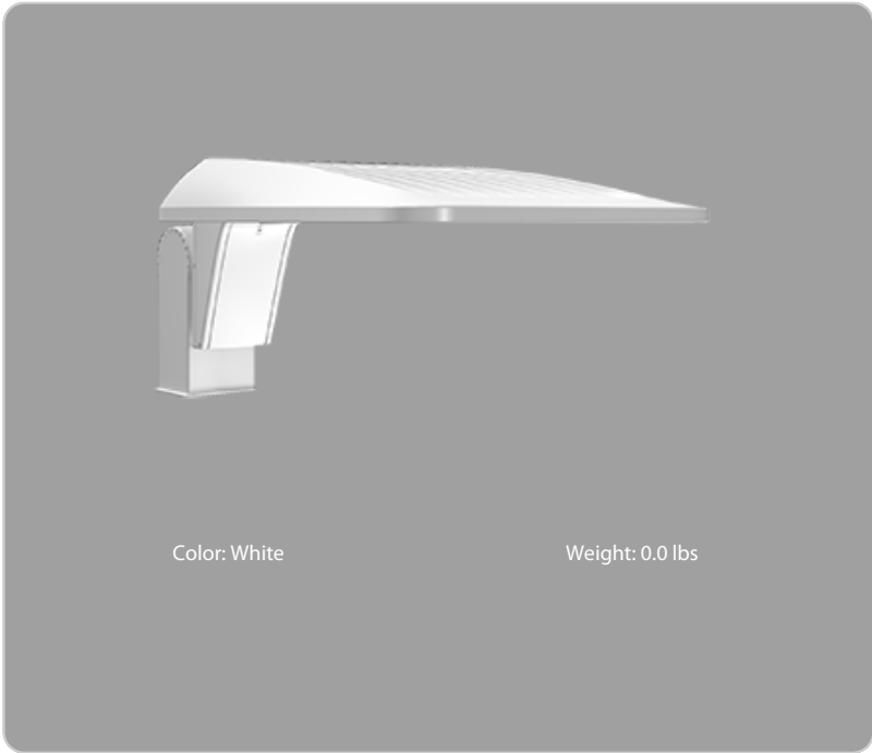
Color: White Weight: 0.0 lbs