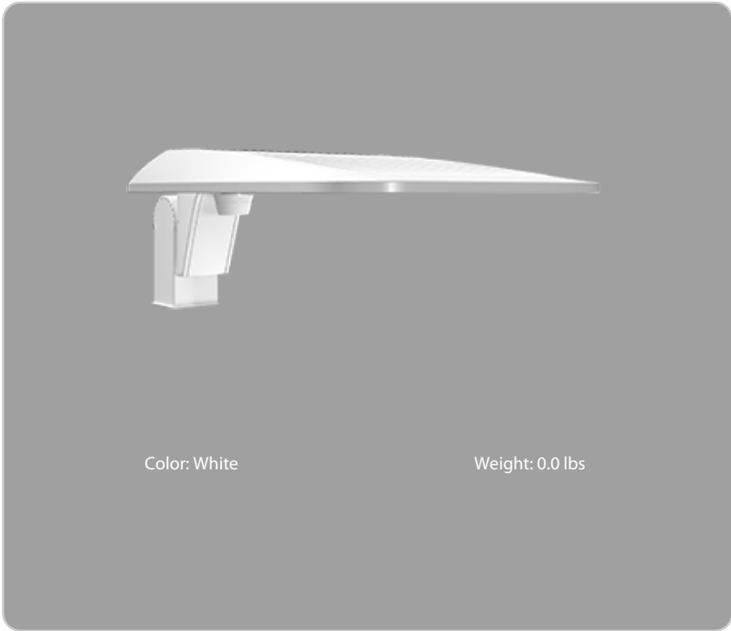
Color: White Weight: 0.0 lbs