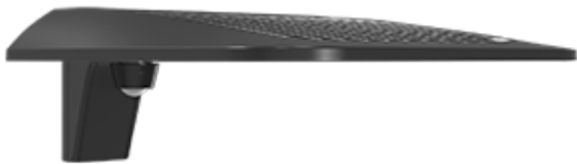
Color: Bronze Weight: 0.0 lbs