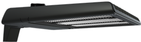
Color: Black Weight: 15.8 lbs