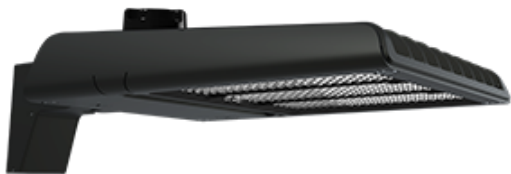
Color: Black Weight: 13.0 lbs